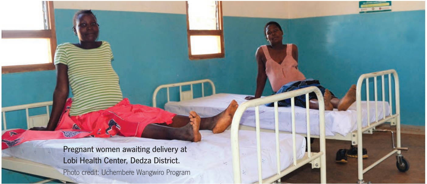
Pregnant women awaiting delivery at Lobi Health Center, Dedza District.

Respondents attributed increased caseload to several factors, some of which are related to RBF4MNH. The primary explanation for increased care-seeking, according to providers and women, was the provision of conditional cash transfers for women who deliver in facilities as part of the RBF4MNH initiative. Additionally, a national policy prohibiting the existence of traditional birth attendants and levying fines against women who have been found to engage in home birth has likely increased demand for facility-based childbirth care.