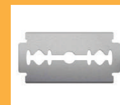
Cutting cord with dirty razor