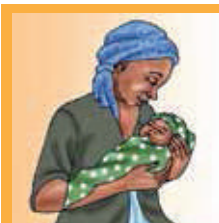
Keep baby warm