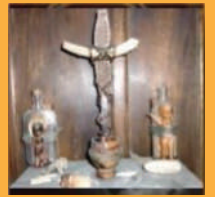
Witchcraft and Owls cannot make your baby sick